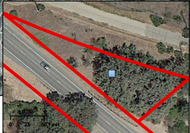
Liberty Canyon Tributary Parcel Acquisition Project - Aerial Map